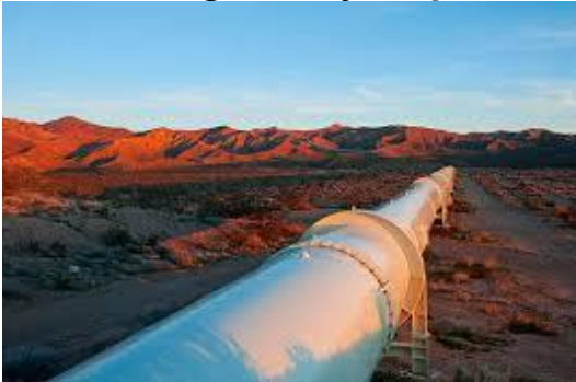
Communication Installation and Monitoring for Major Pipelines