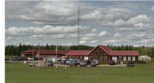
First Nations Connectivity Solutions