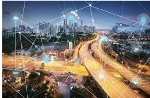
Fiber Installation for Cities and Counties